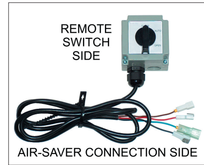
Remote switching kit